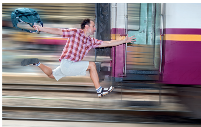
This draft brings to the fore the protection of passengers and their rights

Thus, while in the current PRR, various services could be exempted by the Member States, now this will no longer be the case for national long-distance traffic, and for urban, suburban and regional cross-border traffic. As for traffic to or from countries that are not members of the European Union, an exemption is only possible if the rights of passengers are guaranteed in the Member State granting the derogation (Art. 2 pPRR (1) ).