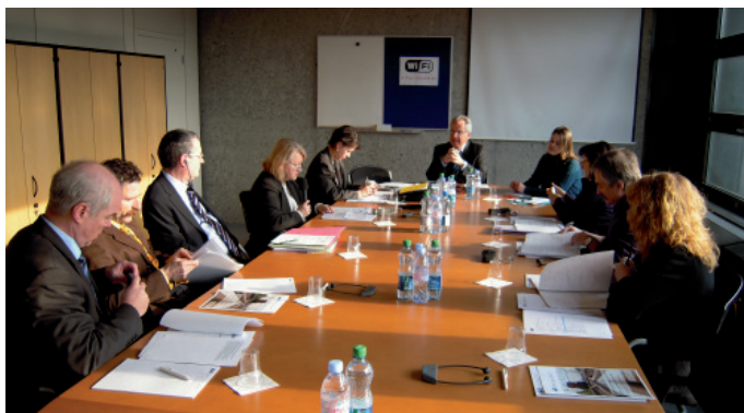
Aftersales Agreements Group of Experts

Handling individual claims for loss and damage in transit is very time-consuming and costly; it cries out for rationalisation. A small CIT group of experts prepared a checklist for after-sales claims handling agreements and submitted it to the meeting of the CIM Working Group held on 19 & 20 October 2010 for its approval. Such agreements improve the quality of transport services and indeed of customer service in general and also allow savings in the costs of handling claims.