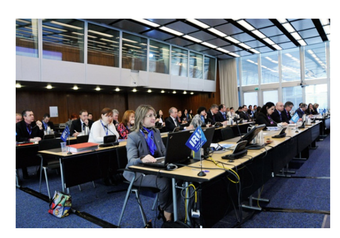
CIT at the 9th IRU Law Symposium